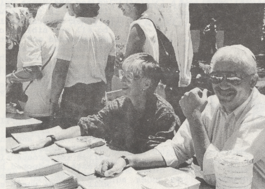
Spreading the word