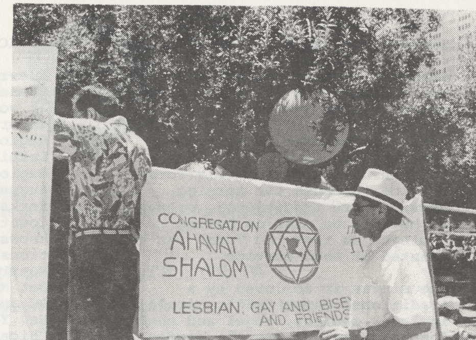
Holding our banner high